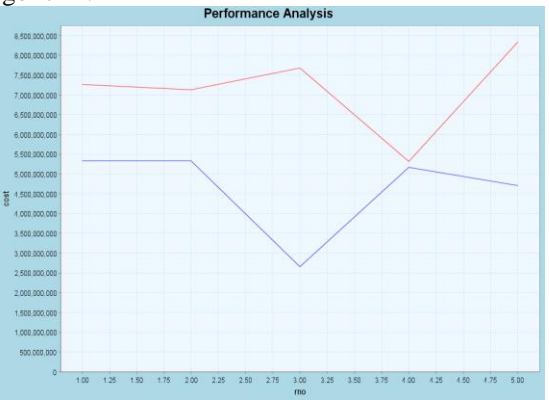
Fig.2: Experimental result about real-world.

The experimental result on real-world data sets is depicted in Fig.2 from which we can see that how total cost get reduced after applying heuristic algorithm.